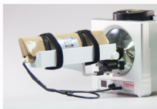
Phoenix S&T Butterfly on EASY-Spray source

The Phoenix S&T Butterfly oven is an envelope column oven in which the column is wrapped, and then closed with velcro straps. This column oven fits both the Nanospray Flex, EASY-Spray (uses built-in temperature control) and CaptiveSpray ion sources.