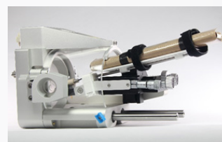
Phoenix S&T Butterfly on Nanospray Flex source

https://phoenix-st.com/product/butterfly-portfolio-heater/