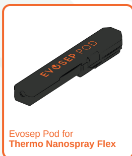
Evosep Pod for Thermo Nanospray Flex