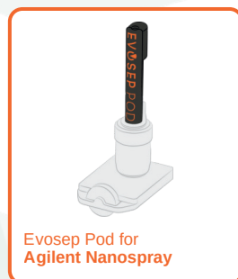
Evosep Pod for Agilent Nanospray